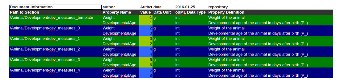
Fig. 2: Example 3: xls representation of the odML structure after first filtering.

However, the resulting table still contains the 'dev_measures_template' section and all its properties, which is not usefull in a printout for a laboratory notebook. To remove this, we apply a second filter: